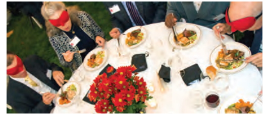
Guests enjoy dinner in the dark.

Despite the rainy night on October 1st, over 200 guests took part in the second installment of The Overbrook Experience, a "Dining in the Dark" style event designed to raise funds for OSB's Technology Program.